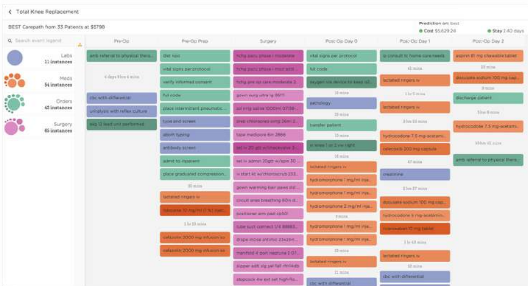
Figure 1: A computed clinical pathway in a patient group.

Each hospital can define which metrics should be measured, for example, length of stay, readmission, or hospital costs. Machine intelligence then calculates several candidate pathways based on the group of patients who have the most desirable outcomes. As the pathways are generated, doctors and nurses can easily compare them to surface the significant differences and how those differences impact patient outcomes. They can then apply their domain knowledge to determine if the variation is unwarranted or if it correlates to a positive patient outcome, thus built into the best practice.